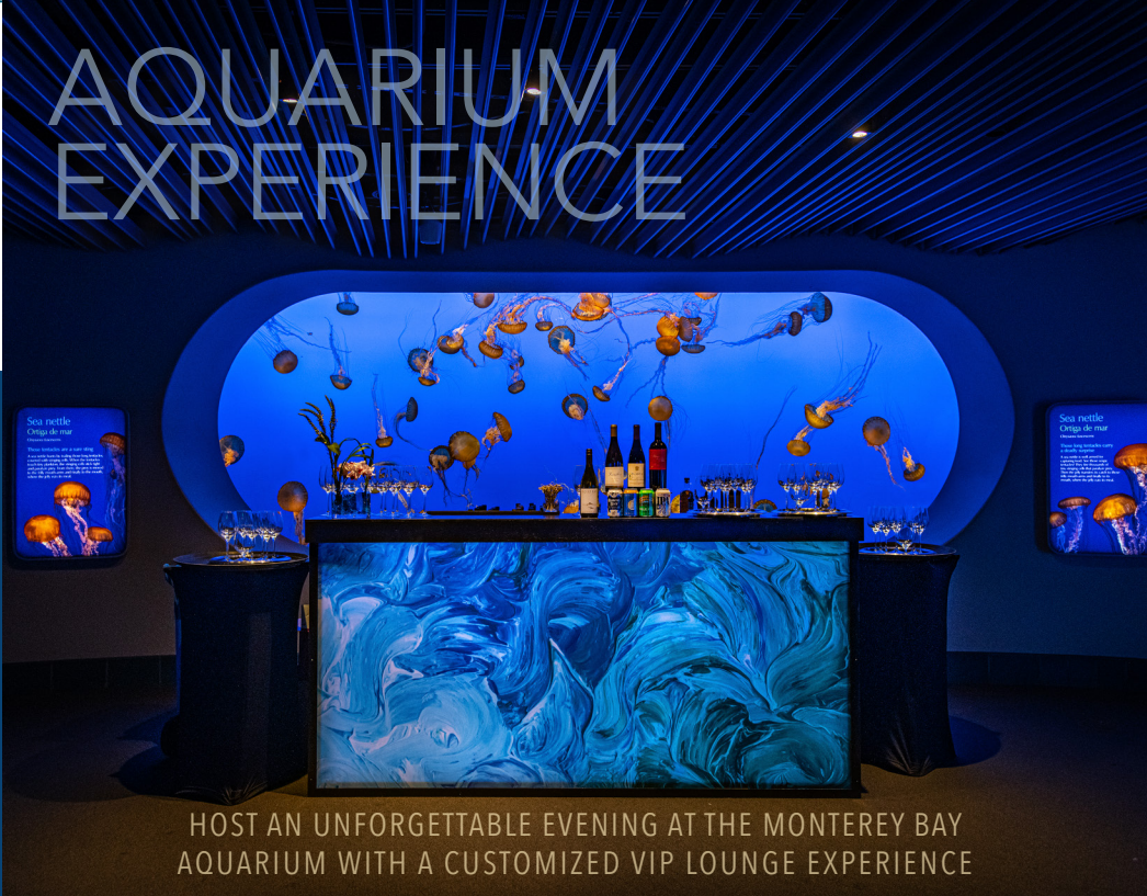
HOST AN UNFORGETTABLE EVENING AT THE MONTEREY BAY AQUARIUM WITH A CUSTOMIZED VIP LOUNGE EXPERIENCE

THIS YEAR'S CLOSING CELEBRATION AQUARIUM EXPERIENCE IS A WORLD OF ITS OWN—and we're doing sponsorships differently. From branded tanks and themed photo ops to playful, educational spark, this is your chance to anchor your brand to WOCON's most talked-about event.