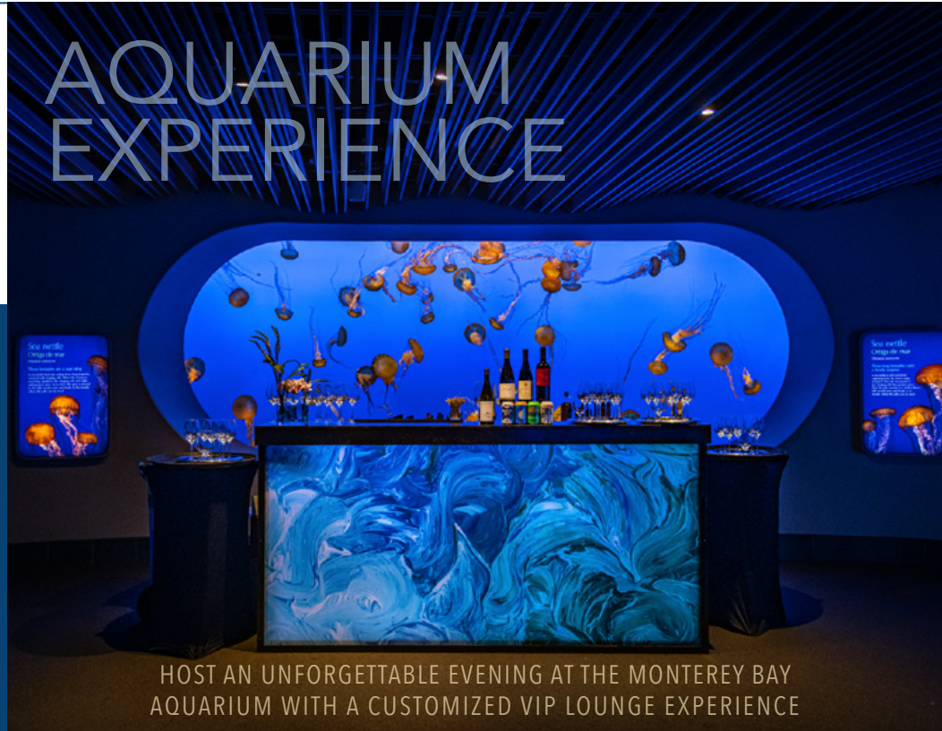
HOST AN UNFORGETTABLE EVENING AT THE MONTEREY BAY AQUARIUM WITH A CUSTOMIZED VIP LOUNGE EXPERIENCE

THIS YEAR'S CLOSING CELEBRATION AQUARIUM EXPERIENCE IS A WORLD OF ITS OWN—and we're doing sponsorships differently. From branded tanks and themed photo ops to playful, educational spark, this is your chance to anchor your brand to WOCON's most talked-about event.