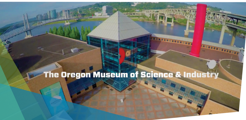
The Oregon Museum of Science & Industry

DJ • DANCING EXHIBITS • FOOD • PHOTO BOOTH CASH BAR • DISCOVERY • FUN!